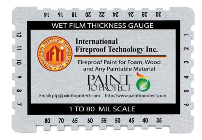
Figure 1. Notch Type Wet Film gauge

Medallions – The benefits of Using Medallions