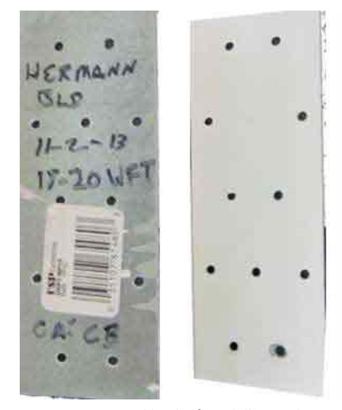
Figure 3. Front and back of Medallions. These mending plates can be purchased at local hardware